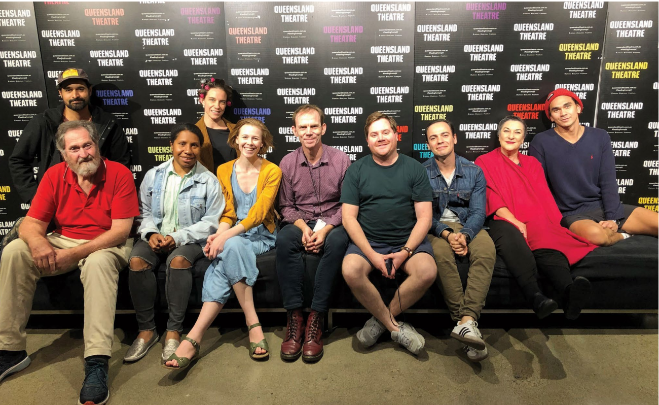
Top left: The cast of Belvoir Theatre's production of The Cherry Orchard take a break from rehearsals during a visit from Equity in May. Top right: Cast of the SBS production Hungry Ghosts, winners of the award for Outstanding Performance by an Ensemble in a Miniseries/Telemovie at the 11th Equity Ensemble Awards in Sydney in May. Bottom: Proud Equity members in the cast of Queensland Theatre Company's 2021 production of The Taming of the Shrew.

concerns about being asked to turn around self-tests within just a few hours.