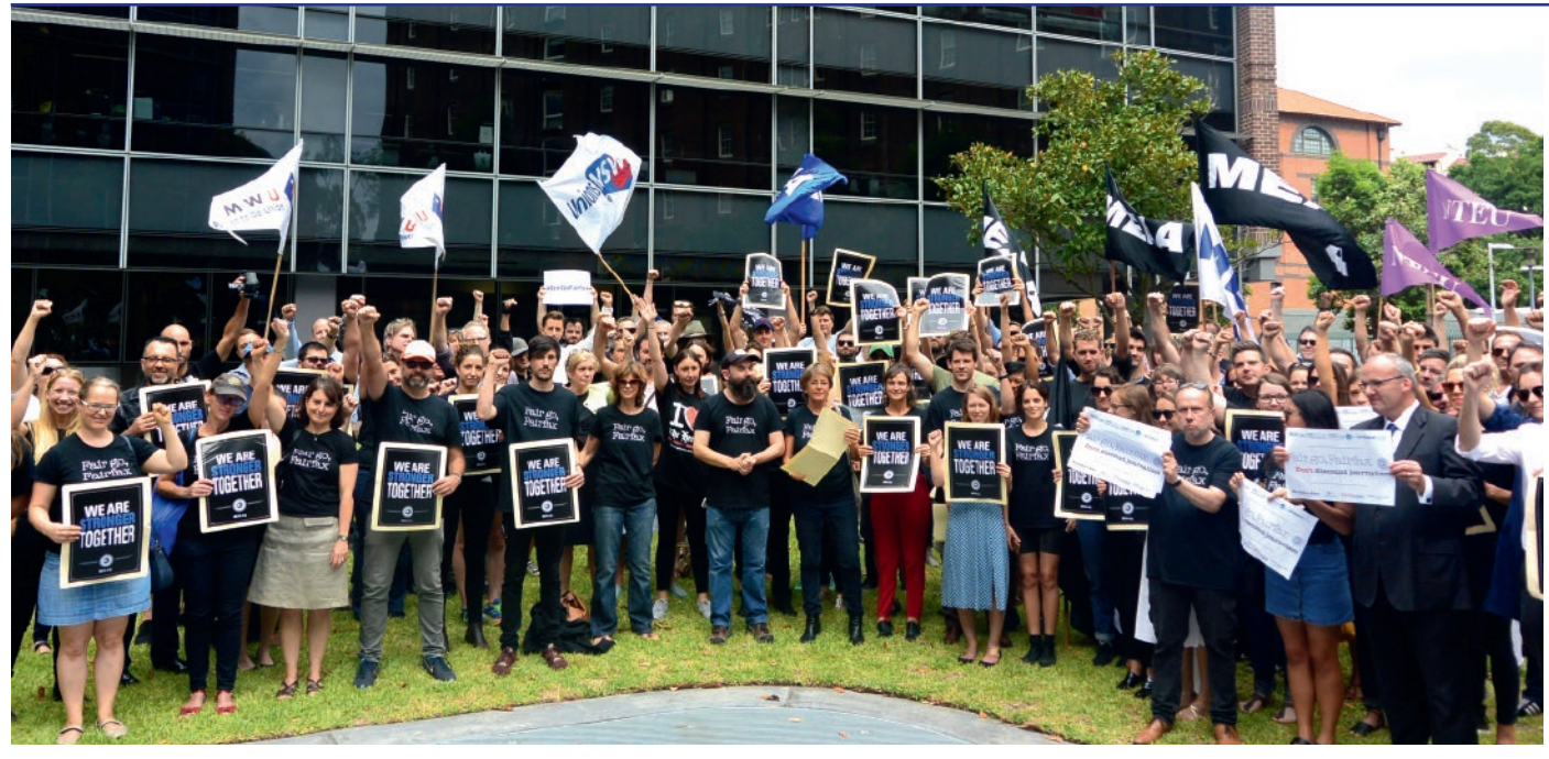
Journalists and other editorial staff from Fairfax Media's Sydney daily newspaper publications rally outside their office on March 18, 2016 to protest against mass redundancies.