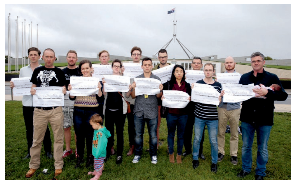
Staff from the Canberra Press Gallery bureaus of The Sydney Morning Herald, The Age, and The Australian Financial Review take action in support of redundant colleagues on March 18.

With members reporting working harder and across more content platforms, workplace campaigns have centred around holding onto current conditions and getting recognition for work intensification and overtime.